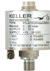
PD-41X Dimensions ø 50 x 62 mm

** Note that the error band will then increase proportionally